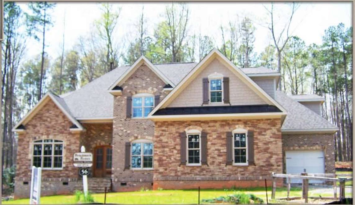
Homesite 56 1433 Tackett's Pond Drive